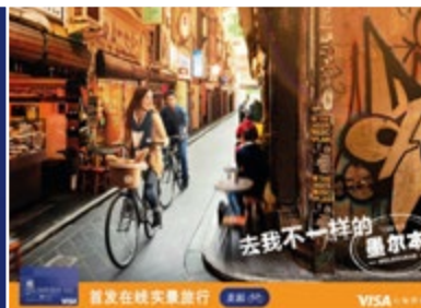
Visa Rental Bike OMD China 2016 Gold Dragon Winner