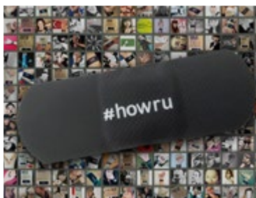
Plaster The Silence TBWA\Group Singapore 2016 Gold Dragon Winner

This year again, all Red, Blue, Gold, Silver and Bronze Dragon Winners will be eligible to compete in the 31st Marketing Agencies Association Worldwide's MAA GLOBES, representing their Clients, their brands and their Agencies, against Winners of Partner Marketing Communications Programmes from all over the globe, to become the very Best of the Best in our Marketing Communications Industry.