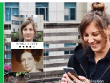
Who Art You DDB China Group 2016 Best Campaign in China Gold Dragon Winner

Entries close 15 May 2017 on: www.dragonsofasia.org