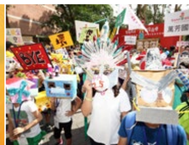
#MyFutureIsMineToSave Ogilvy Public Relations/Ogilvy & Mather Advertising Taiwan 2016 Best Campaign in Taiwan Gold Dragon Winner

Entries close 15 May 2017 on: www.dragonsofasia.org