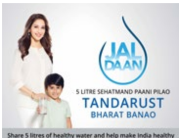
Share 5 litres of healthy water and help make India healthy

Awarded to the campaign which demonstrates the best use of any Social Media delivery platform, such as: Facebook, Twitter, Instagram, Tumblr, Weibo, WeChat, Shazam, Snapchat, WhatsApp & Viral Campaigns etc, as well as the Word of Mouth discipline, as the primary mechanic in the marketing of a product or service, to target audiences.