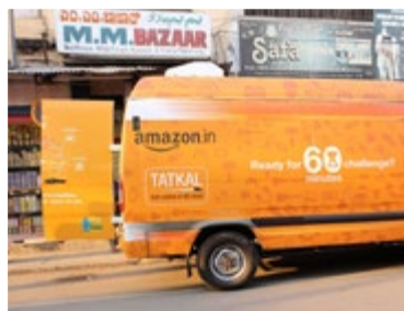
Amazon Tatkal Program Vibgyor Brand Services India 2016 Gold Dragon Winner