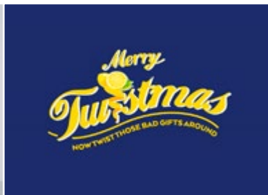
TIGER RADLER: Twistmas Geometry Global Malaysia 2016 Gold Dragon Winner