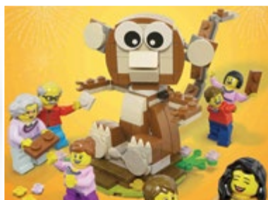
Give The Gift of Play Geometry Global Singapore 2016 Best Campaign in Singapore Gold Dragon Winner