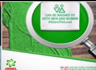
Ariel: Removing the stains of Social Inequality MediaCom India 2016 Gold Dragon Winner