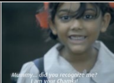
Help a Child Reach 5 PHD India 2016 Best Campaign in India Gold Dragon Winner