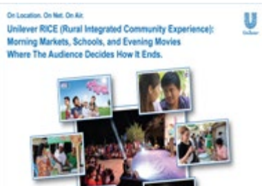
RICE Havas Riverorchid Cambodia 2016 Best Campaign in Cambodia Gold Dragon Winner