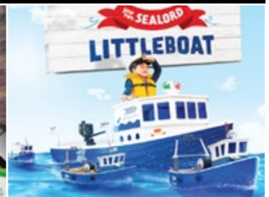
Little Fleet Geometry Global New Zealand 2016 Gold Dragon Winner

Entries close 30 April 2017 on: www.dragonsofasia.com