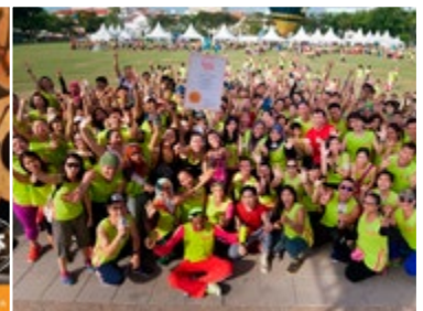
Watsons Zumba Entertains Consumers While Changing Perceptions OMD Malaysia 2016 Gold Dragon Winner