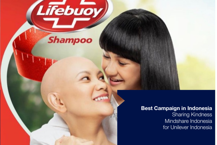
Best Campaign in Indonesia Sharing Kindness Mindshare Indonesia for Unilever Indonesia