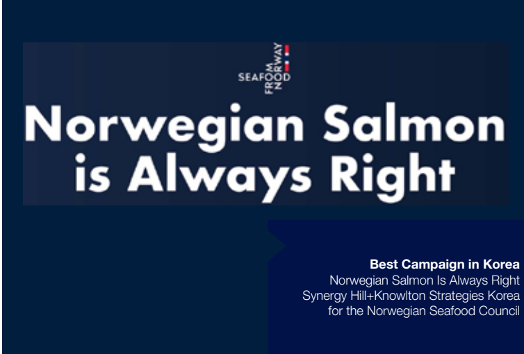
Best Campaign in Korea Norwegian Salmon Is Always Right Synergy Hill+Knowlton Strategies Korea for the Norwegian Seafood Council