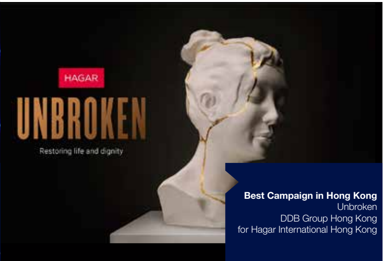
Best Campaign in Hong Kong Unbroken DDB Group Hong Kong for Hagar International Hong Kong