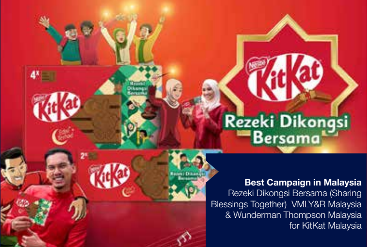
Best Campaign in Malaysia Rezeki Dikongsi Bersama (Sharing Blessings Together) VMLY&R Malaysia & Wunderman Thompson Malaysia for KitKat Malaysia