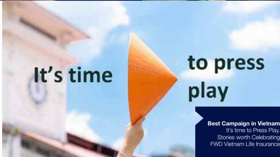
Best Campaign in Vietnam It's time to Press Play. Stories worth Celebrating FWD Vietnam Life Insurance