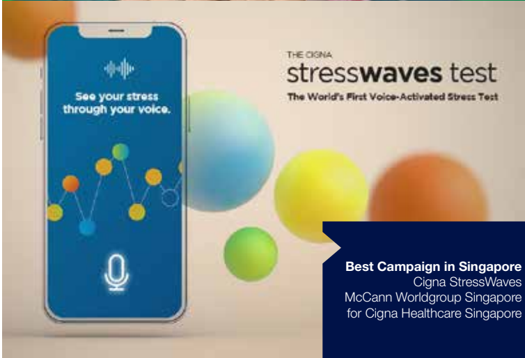
Best Campaign in Singapore Cigna StressWaves McCann Worldgroup Singapore for Cigna Healthcare Singapore