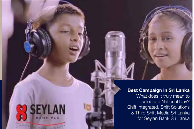
Best Campaign in Sri Lanka What does it truly mean to celebrate National Day? Shift Integrated, Shift Solutions & Third Shift Media Sri Lanka for Seylan Bank Sri Lanka