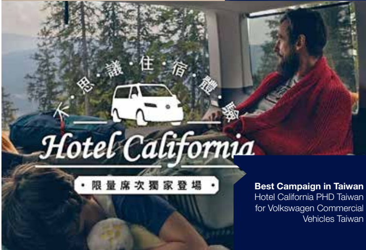
Best Campaign in Taiwan Hotel California PHD Taiwan for Volkswagen Commercial Vehicles Taiwan