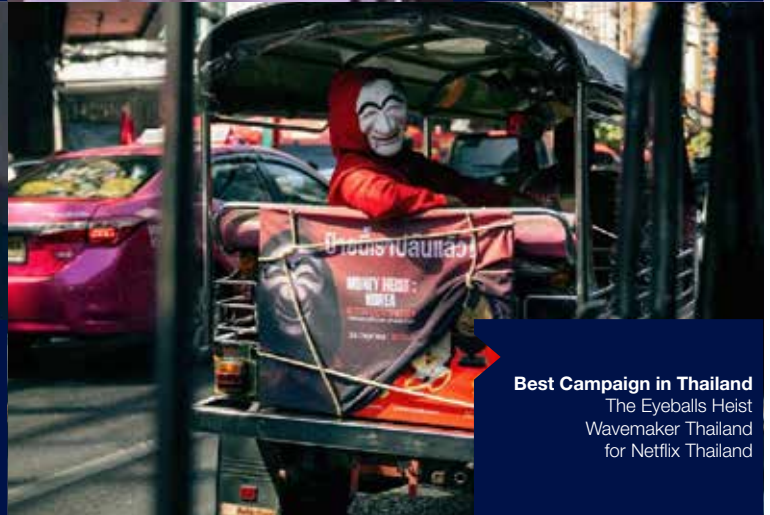
Best Campaign in Thailand The Eyeballs Heist Wavemaker Thailand for Netflix Thailand