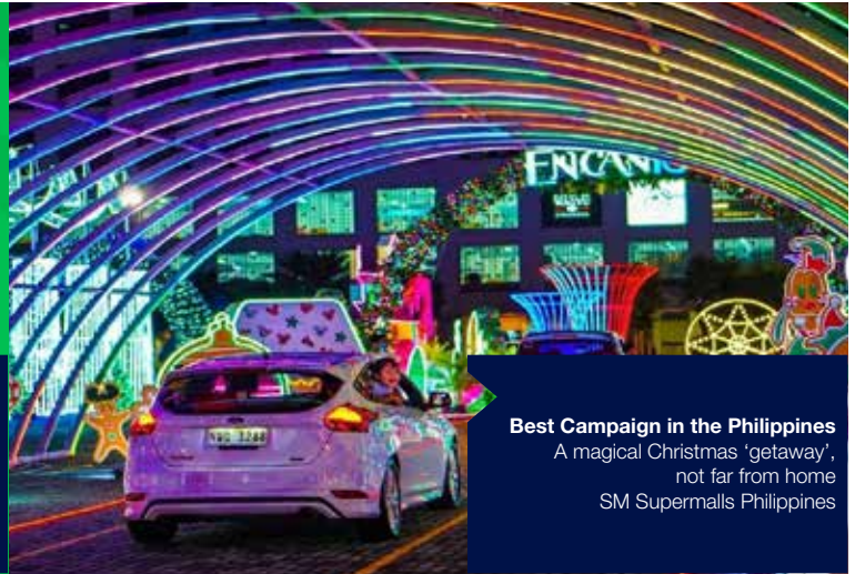
Best Campaign in the Philippines A magical Christmas 'getaway', not far from home SM Supermalls Philippines